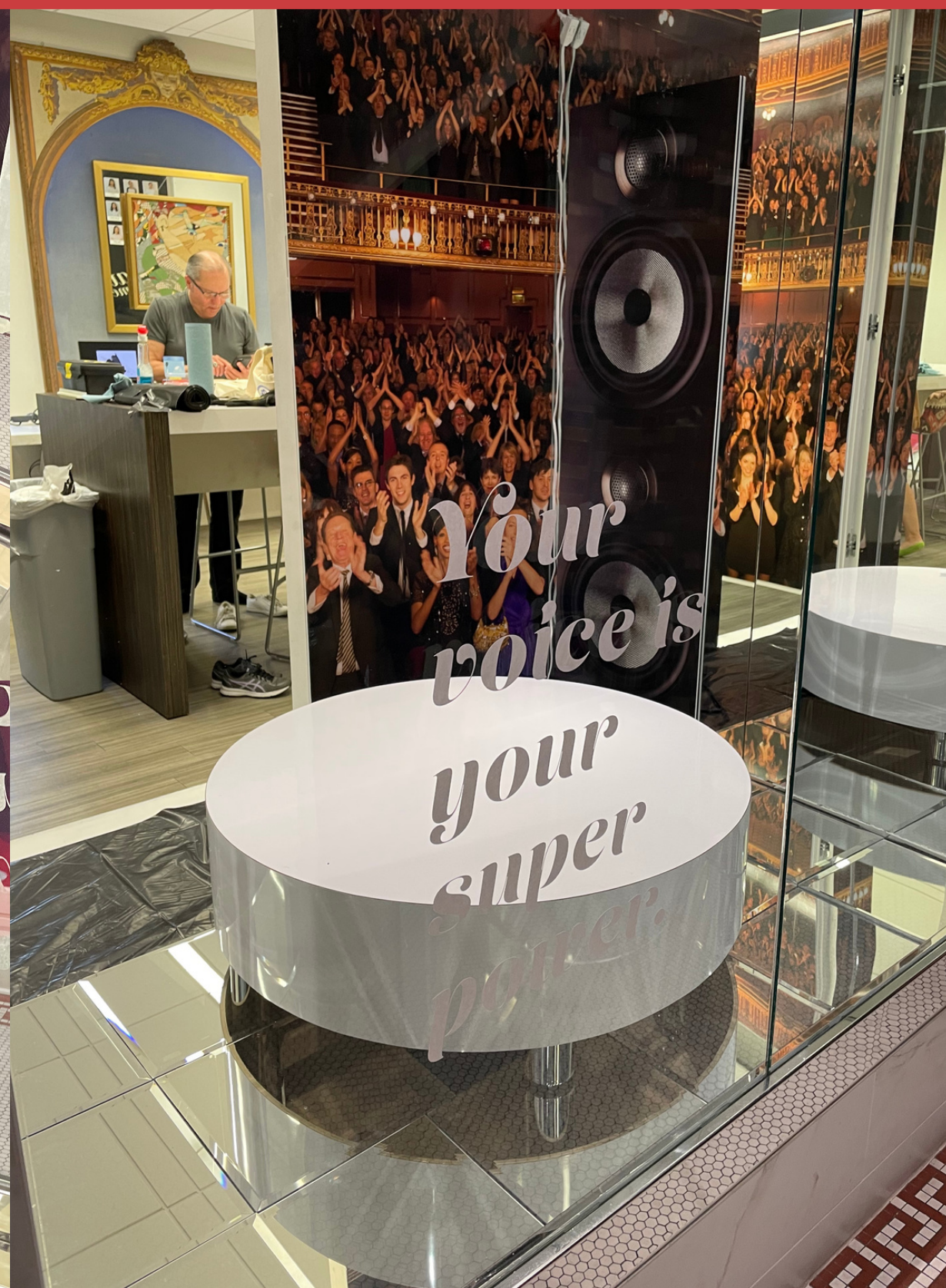
Glass floor and final prop preperation